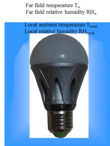
Figure 2 Far field and local field environments in an LED lamp